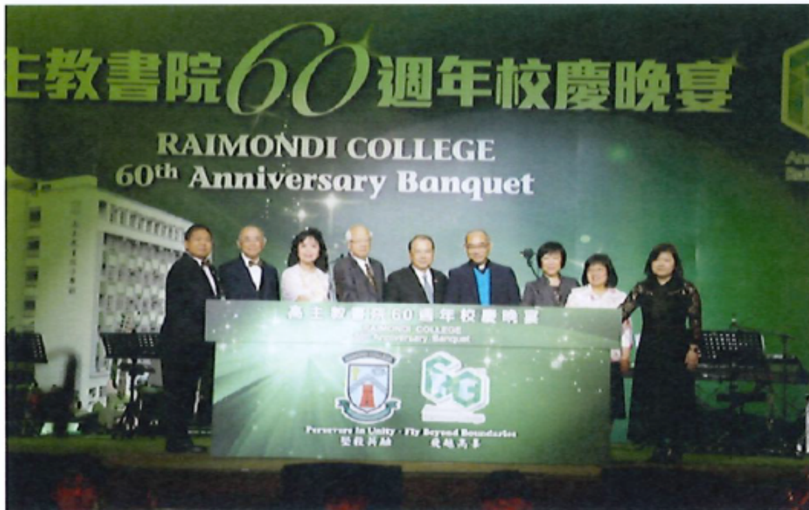
Raimondi College's 60th Anniversary Banquet at Grand Hall of HKCEC on 24th March 2018

During my school age at Raimondi College, I actively involved in the 99 th Hong Kong Scout Troop activities since 1972 and was promoted to Patrol Leader in 1976 then to Venture Scout Leader in 1979. In my years with the 99 th Hong Kong Scout Troop, I practised my leadership and administrative skills and these skills have laid a good foundation to help built my future career. Up to now, I remain involved in supporting the 99 th Hong Kong Scout Troop activities.