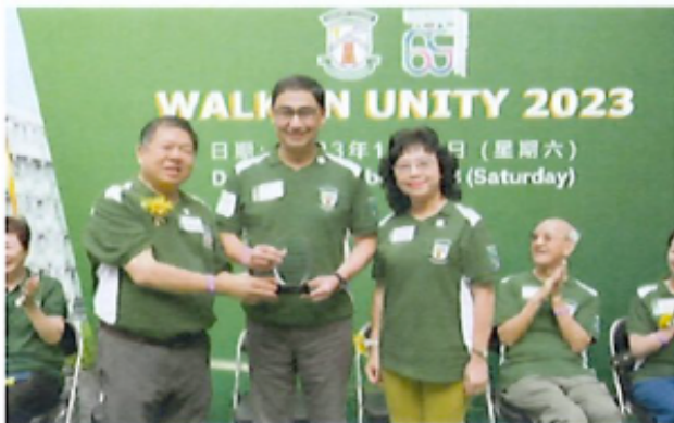
RCPTA ,RAA & RAA Foundation co-ordinated The "Walk in Unity" on 4th Nov, 2023