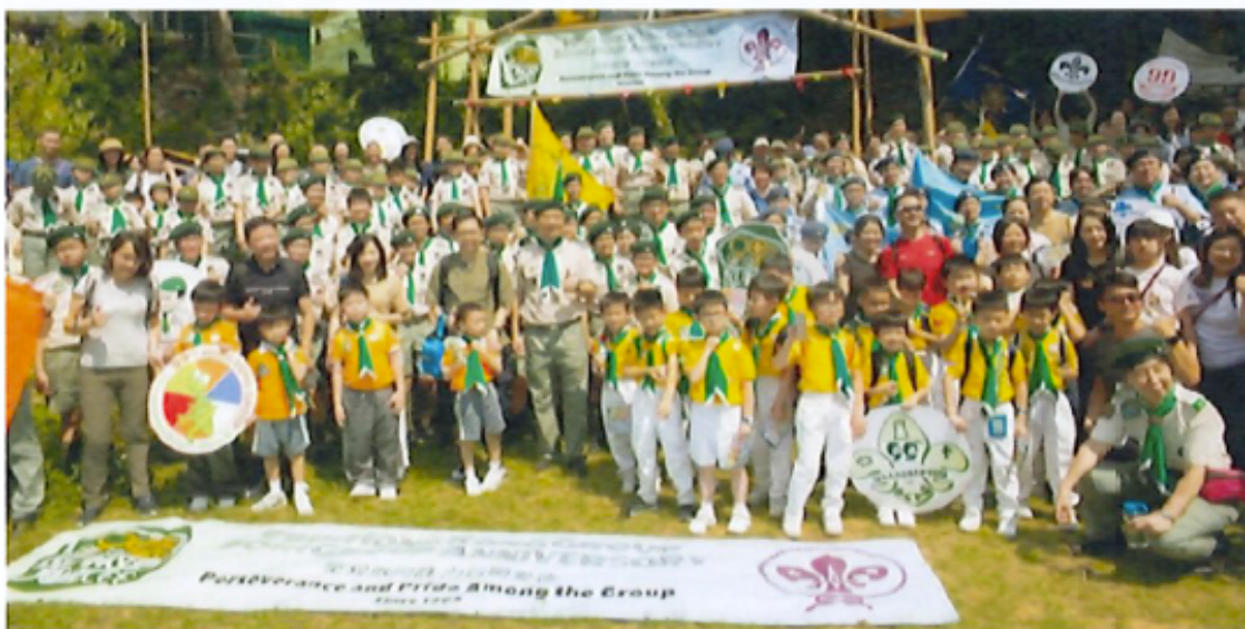
Raimondi College – 99 th HKG's 60 th Anniversary Club Scout Camping on 19-21 April, 2025

Concerning my career. I am the founder and Executive Director of AMC (Exhibits) Limited. I am also the Vice Chairman of the HK Exhibition and Convention Industry Association from 2018 to 2026.